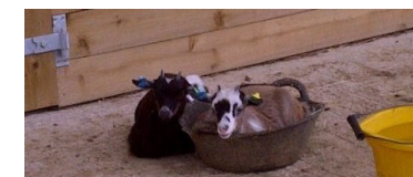
Ronnie & Roxy our resident Pygmy Goats

Cherry Tree Farm Sandfield Lane, Sedgeberrow Evesham, Worcestershire WR11 7QS